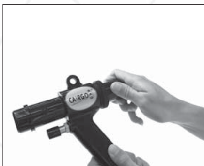
8. Screw the back of the air tool on the air tool.