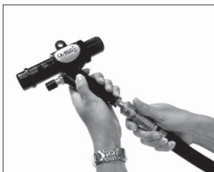
1. Disconnect the air tool from the air tube.