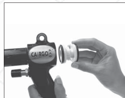
6. Put the yellow insert into the air tool.