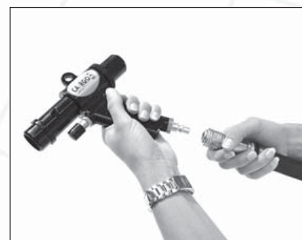
9. Connect the air tool to the air tube again.