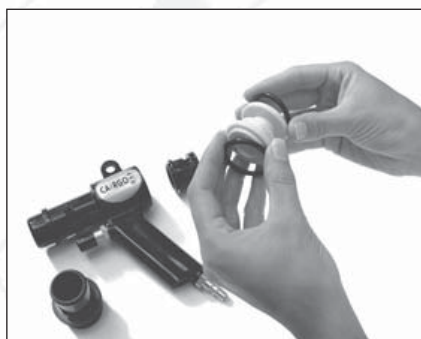
5. Place the two O-rings on the yellow insert.