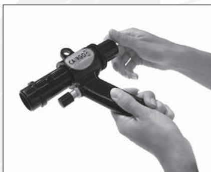
2. Screw off the back of the air tool.