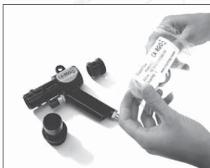
4. Take the supplied yellow insert out of the packaging.