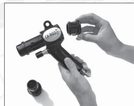
3. Pull the black insert and the O-rings out of the air tool.